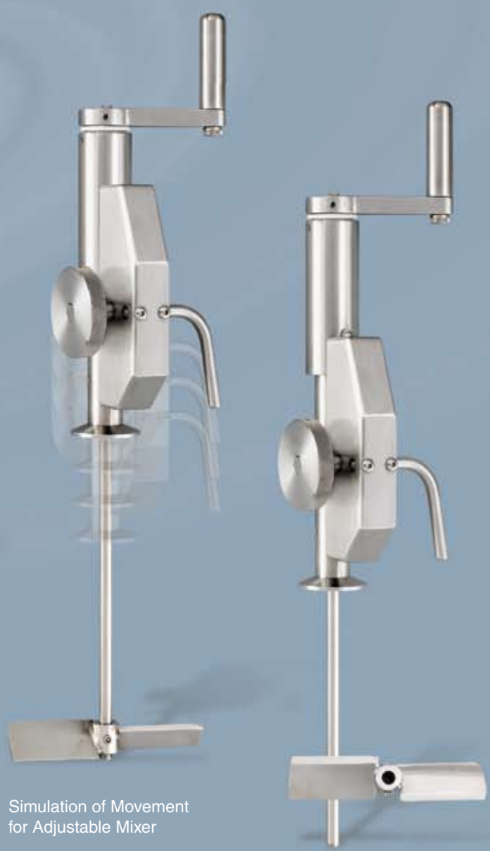
Simulation of Movement for Adjustable Mixer