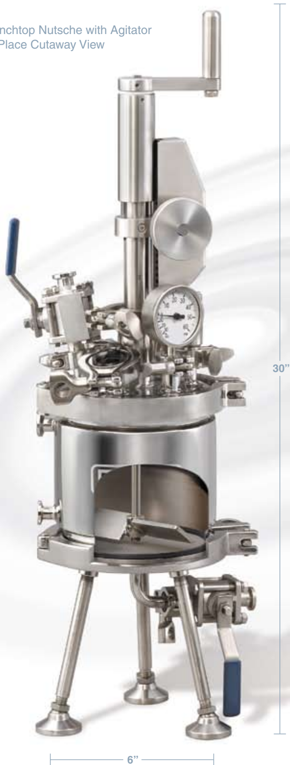
Benchtop Nutsche with Agitator in Place Cutaway View